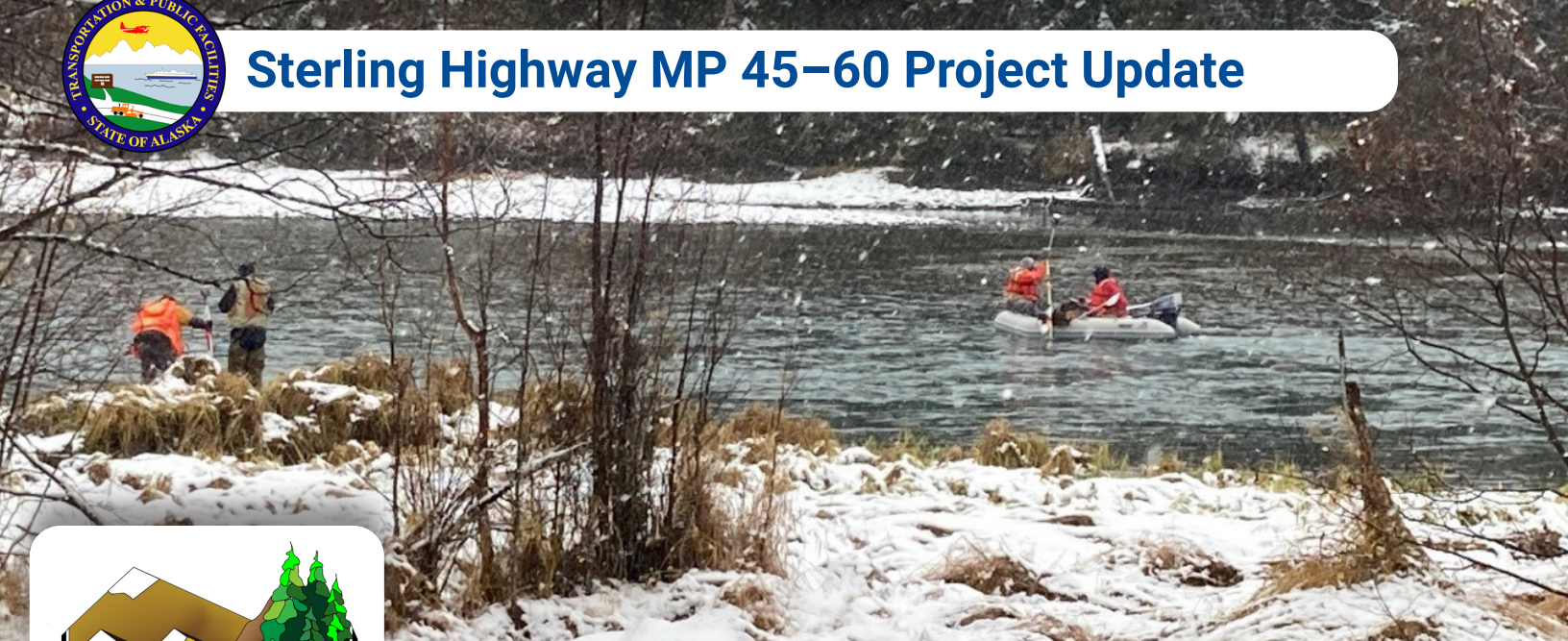
Photo: The Project team conducted Kenai River bathymetric studies during this winter's fieldwork season.